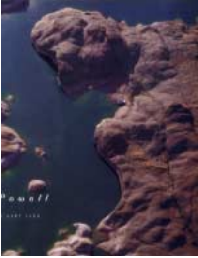
(Photo: A secluded beach on an inlet along Lake Powell's Padre Bay Provides a perfect spot to land for a crew of campers and their houseboat.)