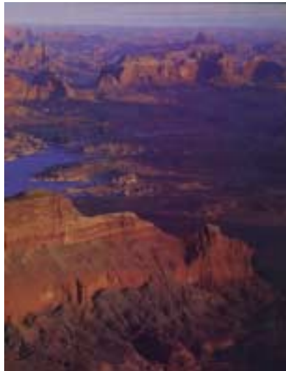
(Photo: Lake Powell's Face Canyon bisects the maze of rugged canyons and buttes that make the lake's geology.)

geologically fleeting, and desert lakes are phantoms. The vision faded, and I dreamed no more.