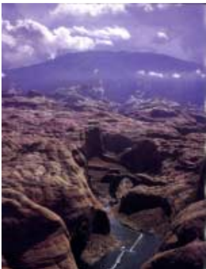
(Photo Rainbow Bridge arcs across Rainbow Bridge Canyon at the base of 10,388 foot-high Navajo Mountain. Boat docks in the canyon allow access to the bridge from Lake Powell.)

When the sunlight broke through again, we were unceremoniously dumped on a clump of blackbrush. I looked around.