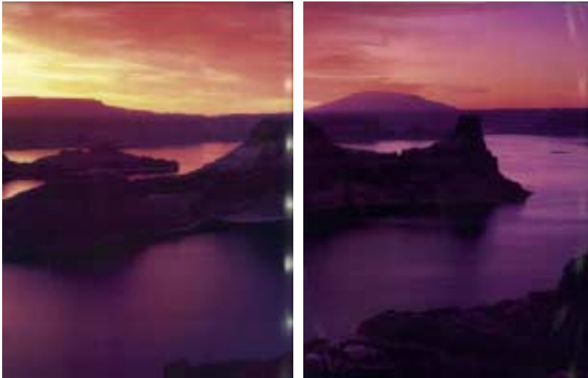
(Photo: A sunrise's vivid colors silhouette Gunsight Butte and distant Navajo Mountain as morning dawns over Padre Bay.)

Soon all sorts of strange watercraft appeared: speedboats, sailboats, houseboats, tour boats, canoes, and more. One by one, either by accident or guile, I rode them all. I saw more territory in a single summer than I had seen in decades of wind-riding.