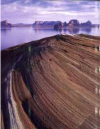
(Photo: Swirling patterns of ancient sand dunes, frozen by time, rim the north shore of Padre Bay.)

In the next few hours, while most of the water was consumed, the bottle was carried up, up, and out to the Rim. Several weeks